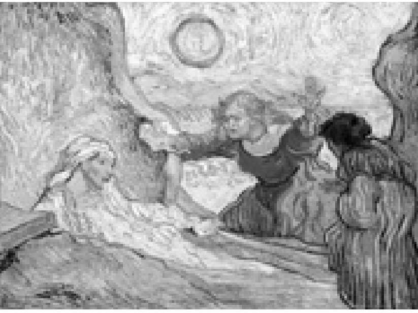
Vincent van Gogh, Raising of Lazarus.